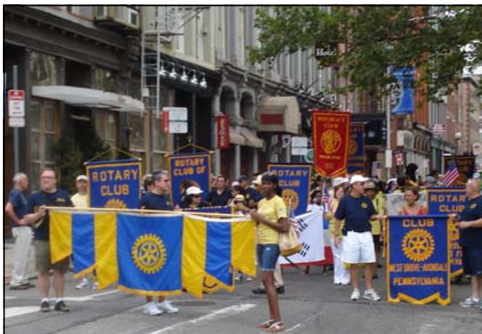
Rotarians march in 2011 July Fourth parade.

Each Rotary Club is asked to make plans now to send a small delegation, including family members, with the Club banner to march in the parade to celebrate Rotary. More details later.