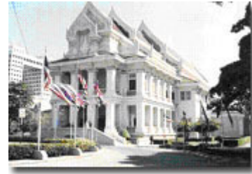
Chulalongkorn University in Bangkok, Thailand.

Application deadline extended: The deadline for submission of district-endorsed applications to The Rotary Foundation has been extended to 1 February 2006.