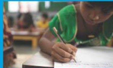
BASIC EDUCATION AND LITERACY