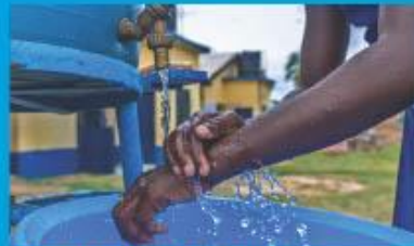
WATER, SANITATION, AND HYGIENE