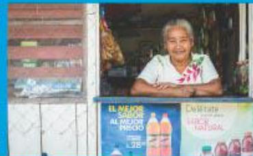
COMMUNITY ECONOMIC DEVELOPMENT