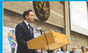
PEACEBUILDING AND CONFLICT PREVENTION