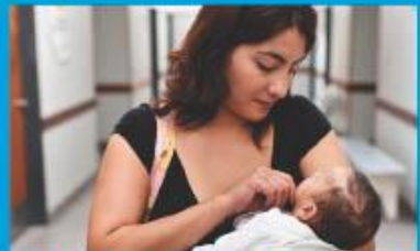
MATERNAL AND CHILD HEALTH