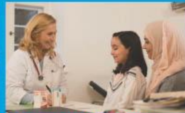
DISEASE PREVENTION AND TREATMENT