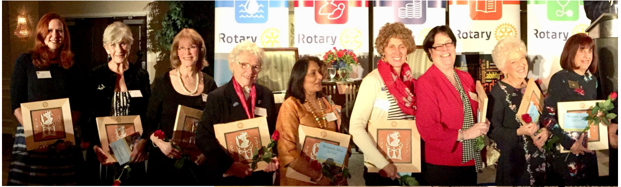
Women Of Rotary Honorees (at right)